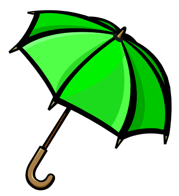
a green umbrella